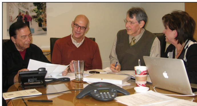
Gifts and Grants Executive Committee meets to plan for the 2012 Convention Campaign.