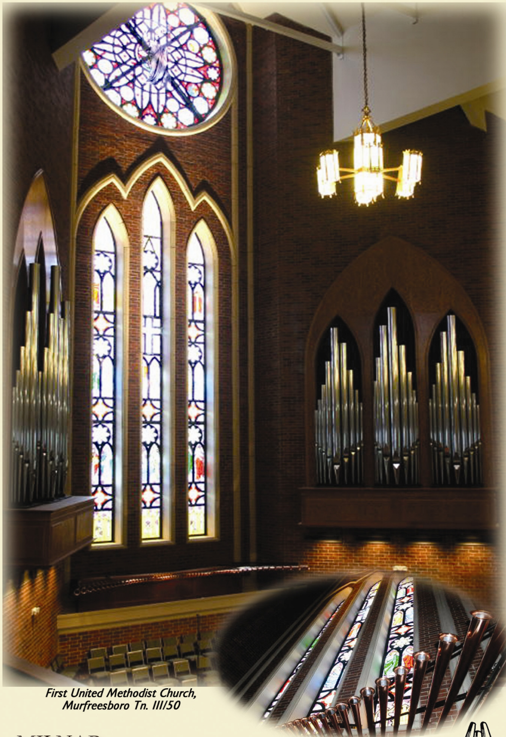
First United Methodist Church, Murfreesboro Tn. III/50